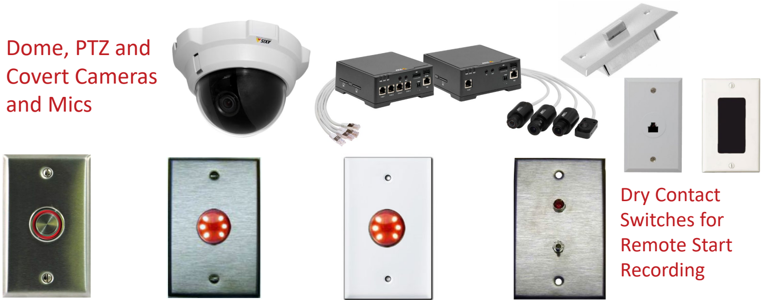
Various Hardware Used