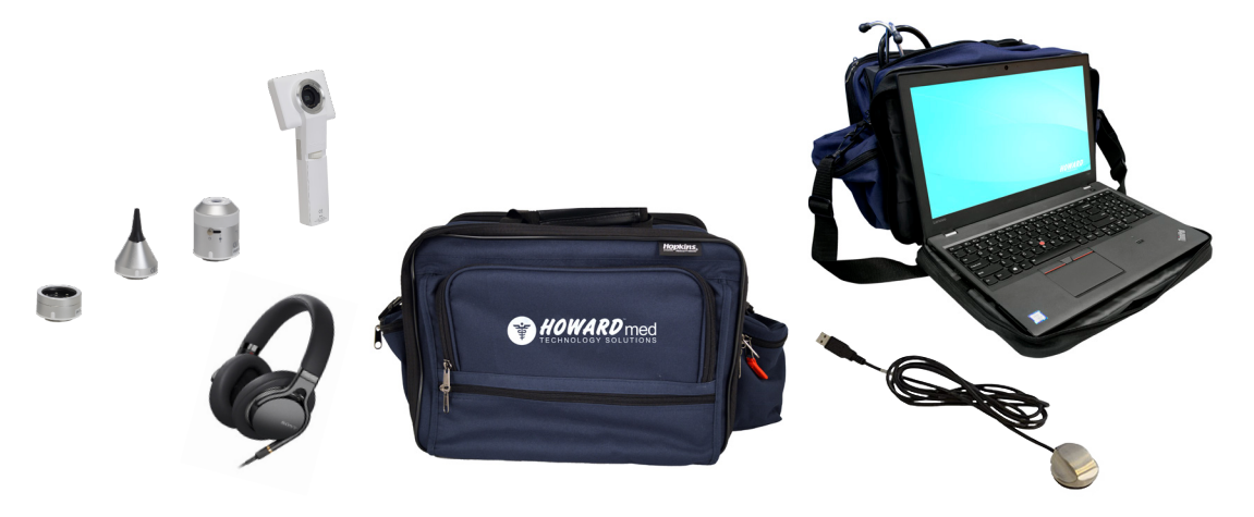
Telehealth Shoulder Bag

The Soft Telemedicine Kit is designed for mobile telehealth applications to improve the level of care in a variety of use case settings. Our light weight, non-powered soft kit provides your facility with a simple and effective approach, allowing you to configure your telemedicine kit for in home care or physician consultation. We incorporate high density foam inserts to securely house your chosen technology or diagnostic devices and offer multiple storage pockets to accommodate multiple configurations.