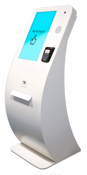
Howard W1 Kiosk