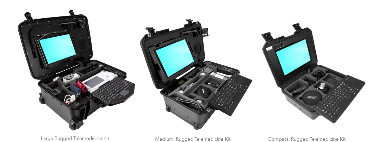
Medium and Large RTK Features

The Rugged telemedicine kit (RTK) is an essential element in providing telemedicine services. This versatile kit can accommodate the equipment necessary to service patients anywhere you intend to go. Our RTK offers a way to expand your telemedicine program beyond the walls of your facility.