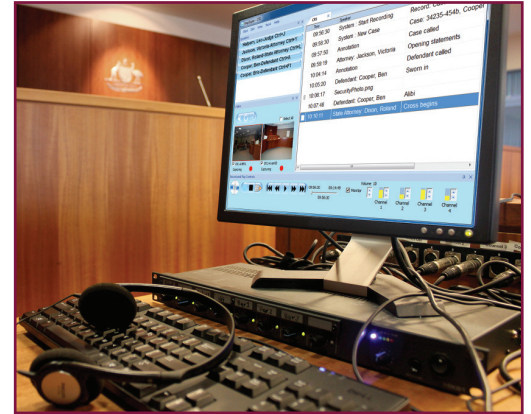
VIQ for Courts

VIQ is compatible with a wide range of video and audio capture hardware to give you the most flexibility. We provide the solution that's right for you, from a single camera and microphone to a country-wide installation of hundreds of courtrooms.