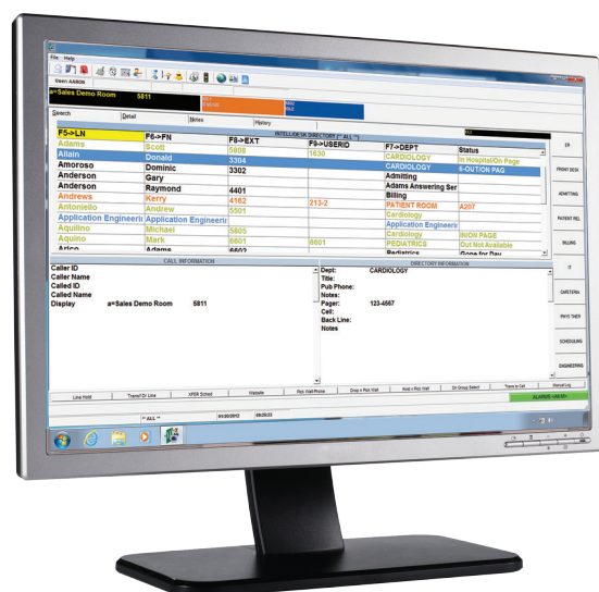
Spok Healthcare Console Select main screen

The Spok Web Directory enables a credentialed user to log in anywhere at any time via web browser to look up staff members, send pages or messages, and view both their own on-call schedule as well as the schedules of others. The Spok Web Directory integrates with your Spok Healthcare Console system to expand these capabilities beyond your operator group, allowing the operators to focus on offering better customer service or other revenue-driving activities—at a lower cost than by increasing the number of full-time employees.