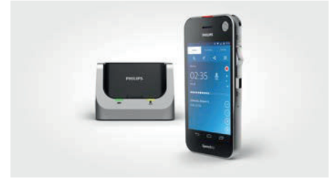
SpeechAir smart voice recorder