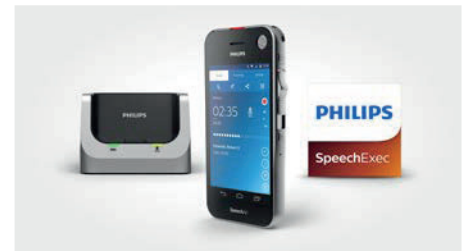
SpeechAir smart voice recorder SpeechExec Pro Dictate workflow software