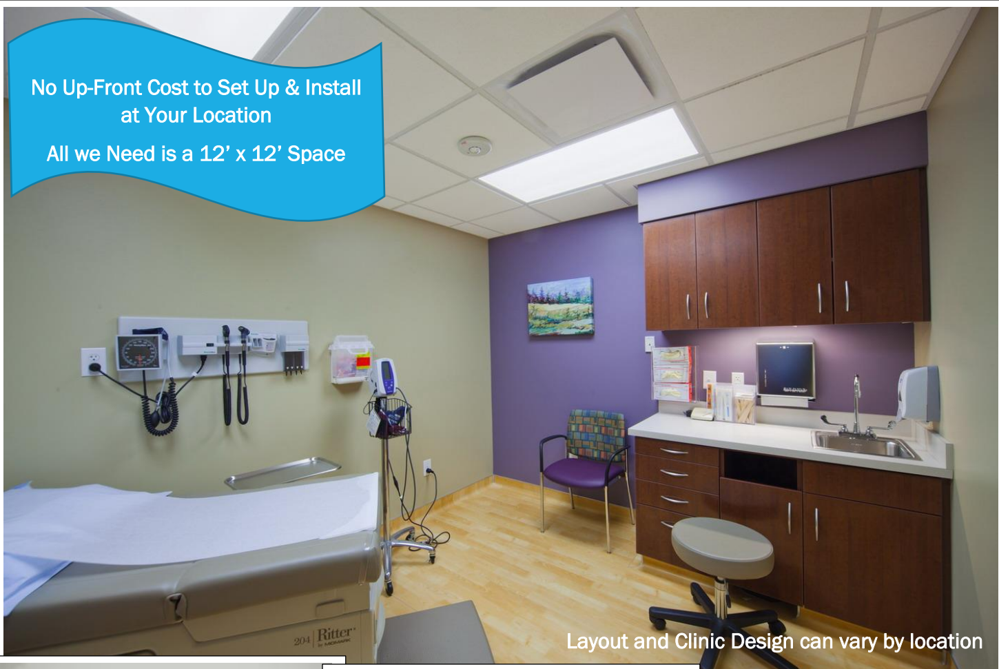
Layout and Clinic Design can vary by location